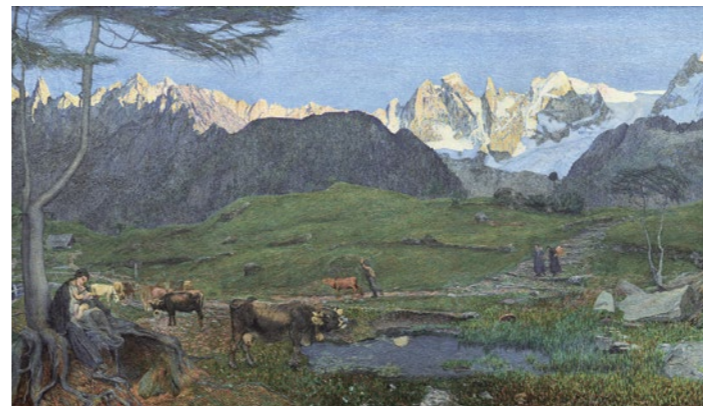
IL TRITTICO DELLA NATURA BECOMING (la vita) Soglio Plan Luder, Giovanni Segantini 1898/99