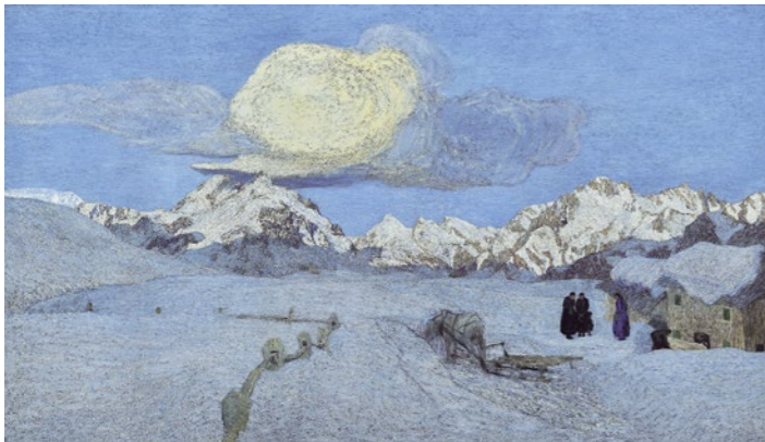
IL TRITTICO DELLA NATURA GONE (la morte) Maloja Pass, Giovanni Segantini 1898/99