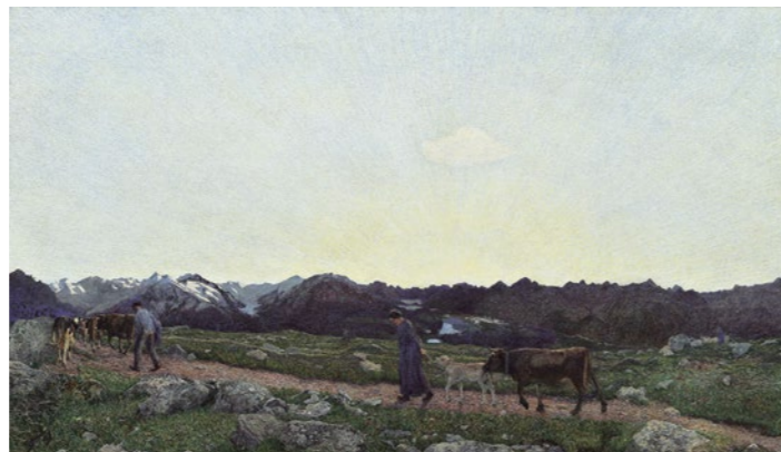
IL TRITTICO DELLA NATURA BEING (la natura) Pontresina Schafberg, Giovanni Segantini 1898/99